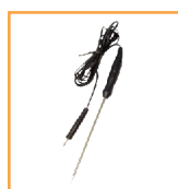
EXTERNAL TEMP. PROBE P/N: VZ87P6AZ1 Color: Black Size: 15cm stainless probe w/handle 3.8mm diameter probe Cable: 116cm W/3.5mm Jack