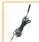
EXTERNAL TEMP. PROBE P/N: VZ87P6AZ2 Color: black Size: 2cm stainless probe w/o handle 3.8mm diameter probe Cable: 200cm w/3.5mm jack