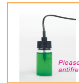
VACCINE STORAGE PROBE P/N: VZ87P6AZ3 Vial: Empty transparent glass Color: black Size: 2cm stainless probe w/o handle 3.8mm diameter probe Cable: 200cm w/3.5mm jack

Please fill glycol (car antifreeze) locally