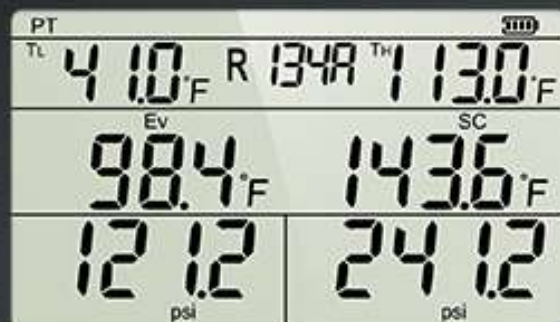
Pressure and Temperature Measurement