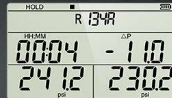
Temperature Compensation for More Accurate Tightness Testing Results