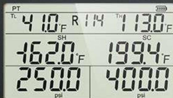
Automatic Calculation of Superheating/Supercooling View the Saturation Temperature