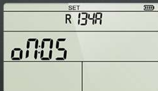
Auto Off Time Settings (5 min, 10min, 15min, 30min, and 60min are selectable)