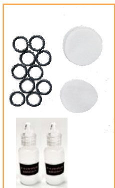
MEMBRANE+ELECTROLYTE PACK P/N:VZ840AAZ Replacement membrane & o-ring, 10 pieces /pack Two vials (25mL) refill electrolyte